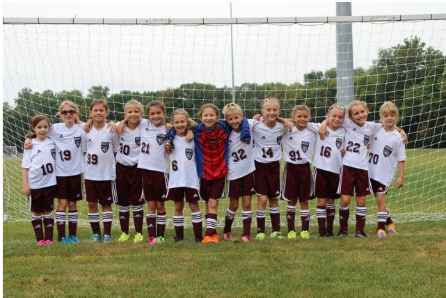
Meet the Pottsgrove Panda's